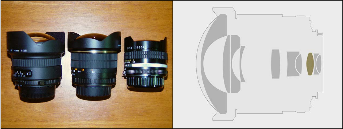
Left Image: The Samyang 8 mm lens front element (center) is curved almost as much as that of the 14 mm Sigma rectilinear lens (left), and likely plays a role in achieving stereographic projection. The front element of the Nikon fisheye at right has a relatively shallow curvature. Right Image: 8 mm f/3.5 Samyang lens optical design diagram, from Samyang web site. [1]

In a lens, the radial distribution of its image can be controlled by the relative angles of refraction at the front versus the back of the forward optical elements. For example: