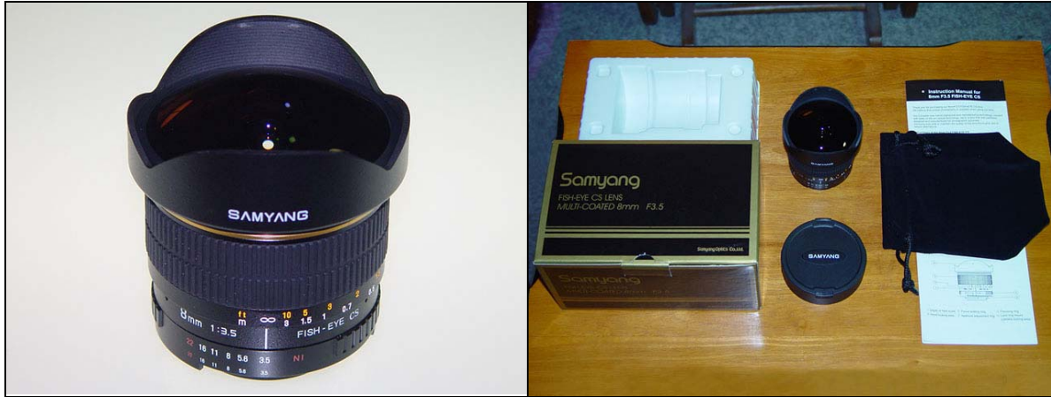
Left: Samyang 8 mm f/3.5 Wide Angle Lens. Right: Lens with box, caps, pouch, and manual.