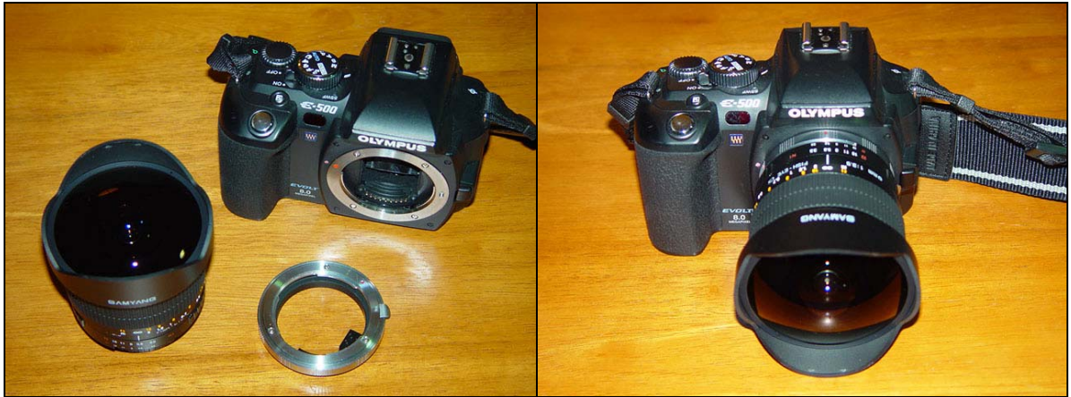
Left: Nikon mount Samyang 8 mm f/3.5 lens, shown with a Nikon to Olympus 4/3 adapter and Olympus E-500 camera. Right: Samyang 8 mm lens mounted on Olympus E-500 via a Nikon to 4/3 adapter. Need an “affordable” ultra wide lens for 4/3 format? Problem solved!